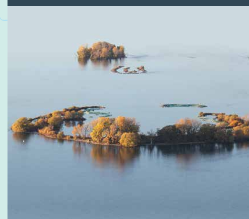
Strawberry Islands (foreground), Frog Island and Motor Island (2016).