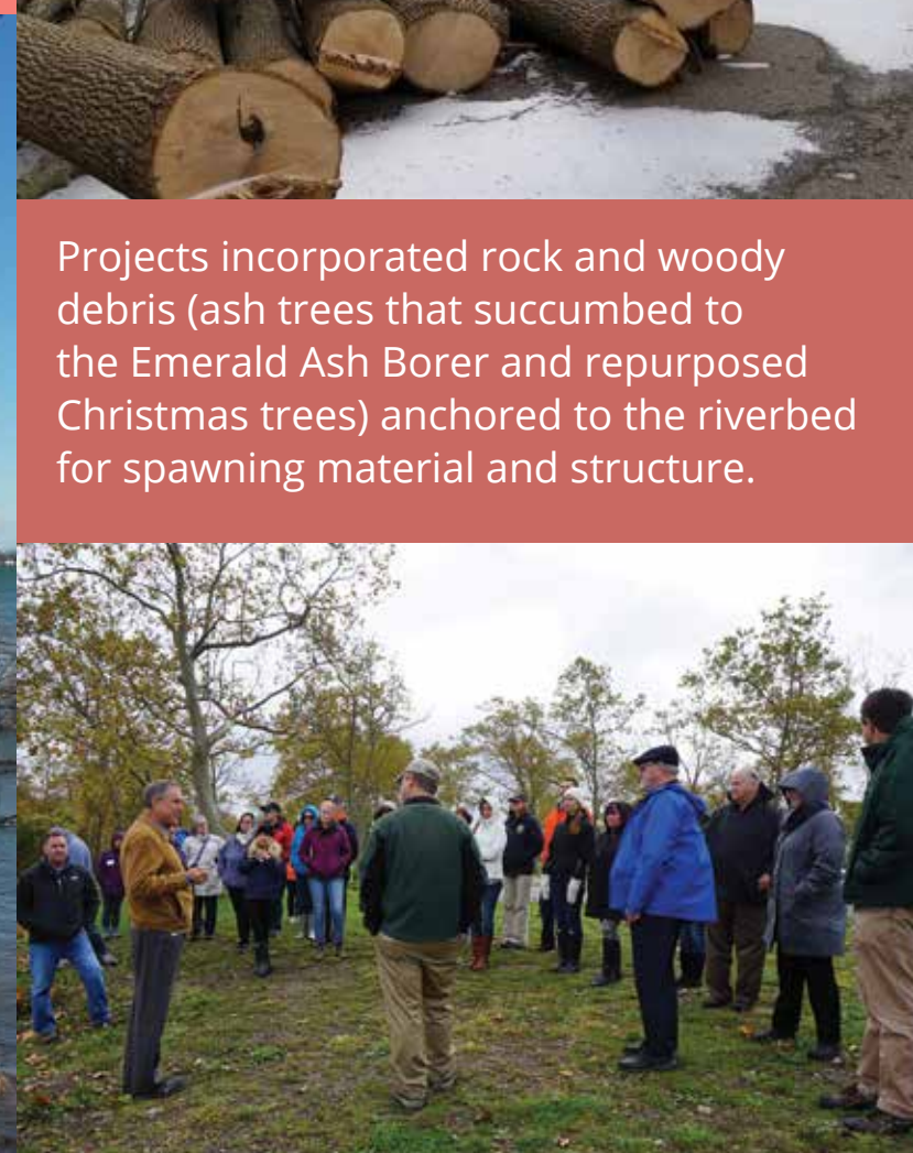
Projects incorporated rock and woody debris (ash trees that succumbed to the Emerald Ash Borer and repurposed Christmas trees) anchored to the riverbed for spawning material and structure.