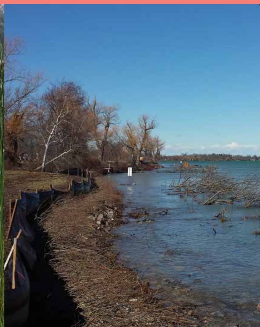
Restoration work in progress at Boyer's Creek (#4).