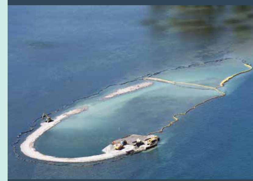
After dredging stopped, river flows caused significant erosion. Frog Island (#11) disappeared by 1985. Photo shows restoration activities in progress.