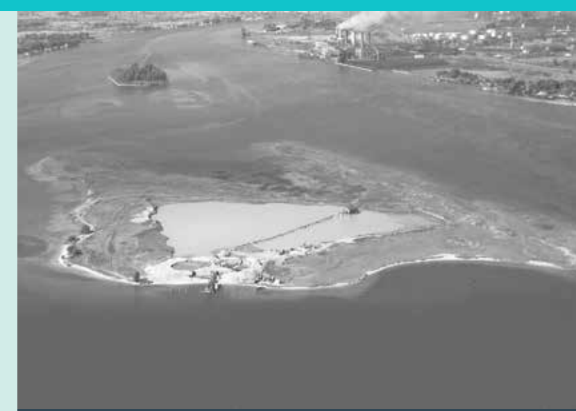
Disposal of dredge spoils occurred in the Upper Niagara River from about 1815 to 1910. Extensive sand and gravel mining followed from 1912 to 1953 which altered the size, shape, and number of islands over time.