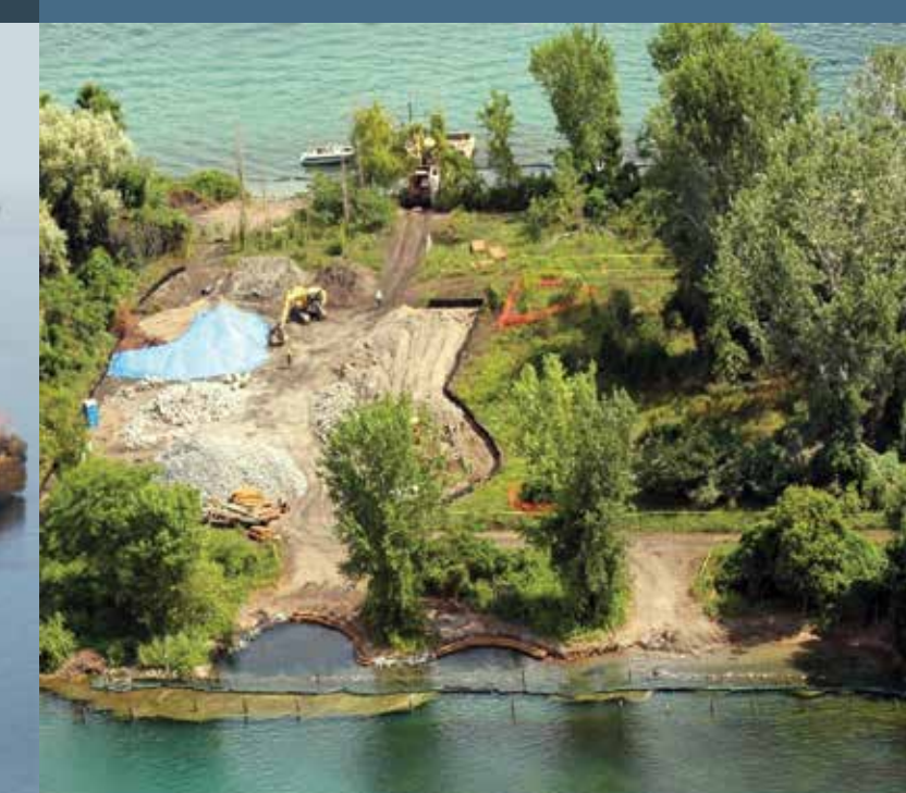
Habitat construction on Motor Island (2011).