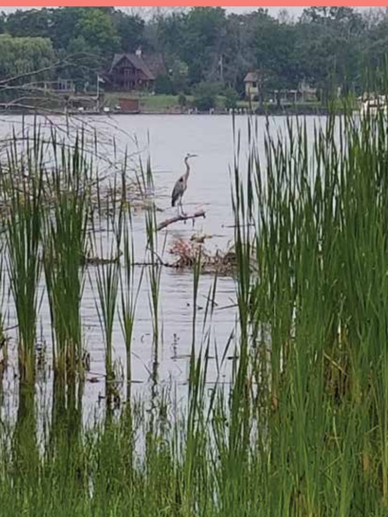
Wetland vegetation established quickly. Wildlife and anglers seen using sites indicate project success.

To date, the completed projects resulted in 2.6 ha (6.3 ac) of wetland habitat, 3 km (1.9 mi) of improved shoreline, and thousands of native plants. The Niagara Parks Commission has targeted having 75% of the Canadian Niagara River shoreline covered in native vegetation by 2028.