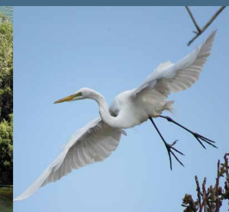
Great Egret